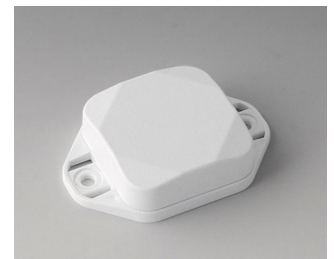
B1802127 MINI-DATA-BOX SF40, flat, with flanges ASA+PC (UL 94 V-0) traffic white RAL 9016 40x40x15mm IP 65 opt., IP 40