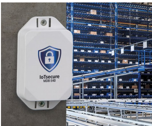
Access authorization of transponders