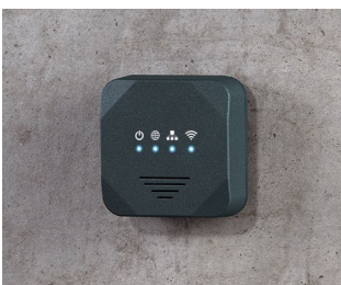
Wireless Access Point