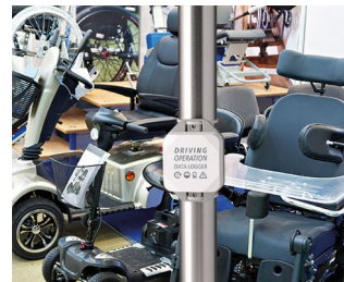
Data logger for Driving Operations