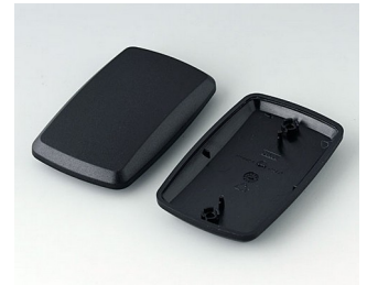
B9006856 Bottom and top part EL PMMA (IR) (UL 94 HB) black RAL 9005 78x48x20mm