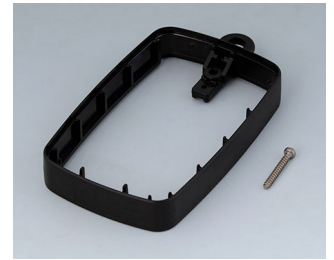
B9004786 Intermediate ring EM, high PMMA (IR) (UL 94 HB) black RAL 9005