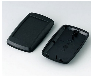
B9004806 Bottom and top part EM PMMA (IR) (UL 94 HB) black RAL 9005 68x42x18mm