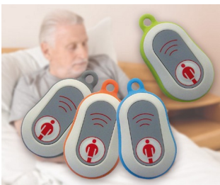
Radio paging systems