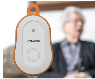
LoRa GPS tracker with alarm button