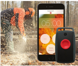
A personal alarm on your mobile phone