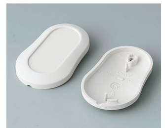
B9002907 Bottom and top part DS ABS (UL 94 HB) off-white RAL 9002 51x32x13mm