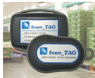
RFID sensor transponder and data logger