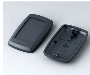
B9002808 Bottom and top part ES ABS (UL 94 HB) lava 52x32x15mm