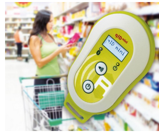
Mobile UHF RFID scanner