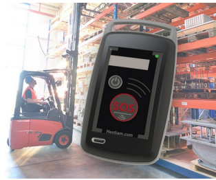
Mobile Security Solutions for workers