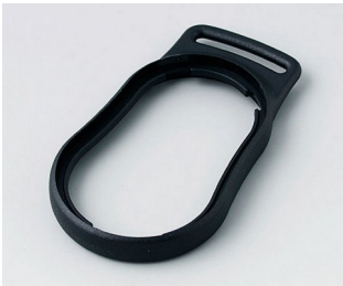
B9002306 Intermediate ring DS PMMA (IR) (UL 94 HB) black RAL 9005