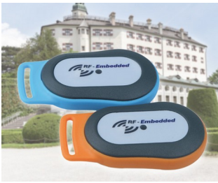
Mobile RFID information system