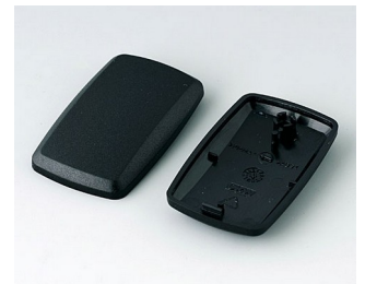
B9002856 Bottom and top part ES PMMA (IR) (UL 94 HB) black RAL 9005 52x32x15mm