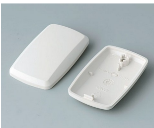
B9002857 Bottom and top part ES ABS (UL 94 HB) off-white RAL 9002 52x32x15mm