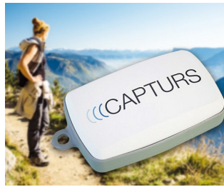
GPS tracking in real time