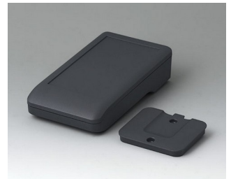
A9005218 DATEC-COMPACT S ASA+PC (UL 94 V-0) lava 136x74x32mm IP 41