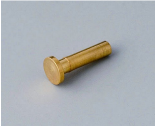
A9193030 Contact pin gold-plated