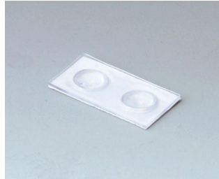
A9207150 Anti-slide feet 6.5 x 2 mm transparent

Subject to technical modification without notice. © by OKW Gehäusesysteme, Buchen/Germany.