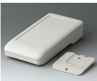
A9006207 DATEC-COMPACT M ASA+PC (UL 94 V-0) off-white RAL 9002 172x92x39mm IP 65