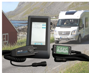
System for leak detection in leisure vehicles