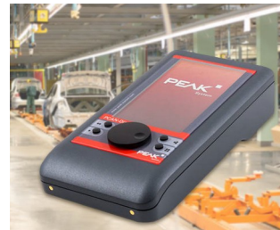
Mobile diagnostic device for CAN and CAN FD buses