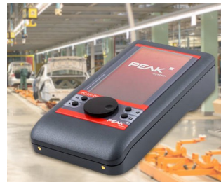
Mobile diagnostic device for CAN and CAN FD buses