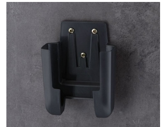
A9106628 Holder M ASA+PC (UL 94 V-0) lava