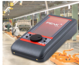
Mobile diagnostic device for CAN and CAN FD buses