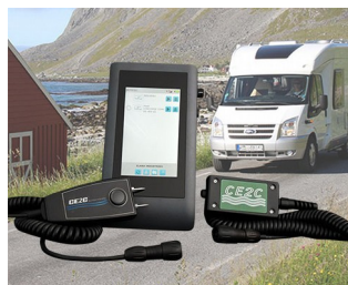
System for leak detection in leisure vehicles