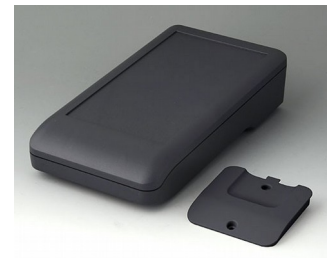
A9007218 DATEC-COMPACT L ASA+PC (UL 94 V-0) lava 206x110x47mm IP 41