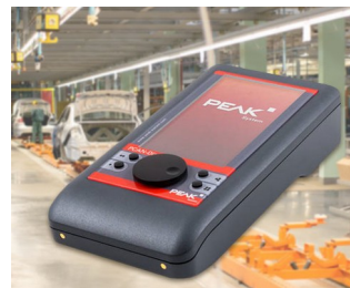
Mobile diagnostic device for CAN and CAN FD buses