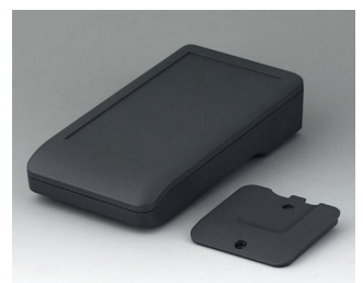
A9006218 DATEC-COMPACT M ASA+PC (UL 94 V-0) lava 172x92x39mm IP 41