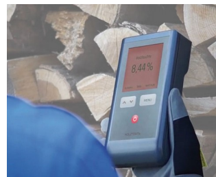
Wood moisture measuring device