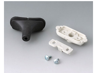
B2911309 Cable gland kit, 3.4 - 4.2 TPE black RAL 9005