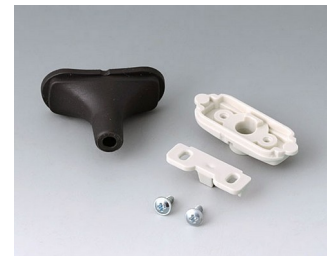
B2911329 Cable gland kit, 5.0 - 5.9 TPE black RAL 9005