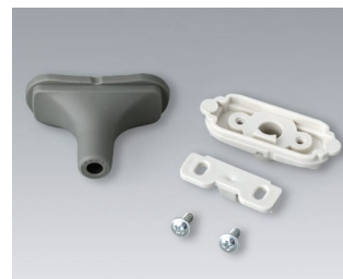
B2911328 Cable gland kit, 5.0 - 5.9 TPE volcano