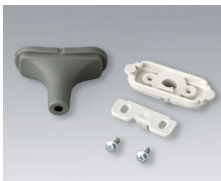
B2911318 Cable gland kit, 4.2 - 5.0 TPE volcano