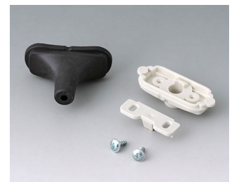
B2911309 Cable gland kit, 3.4 - 4.2 TPE black RAL 9005