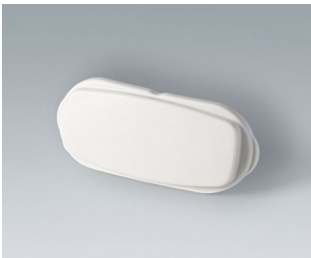
B2811207 End part ASA+PC (UL 94 V-0) off-white RAL 9002