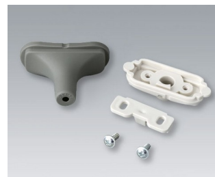
B2911308 Cable gland kit, 3.4 - 4.2 TPE volcano