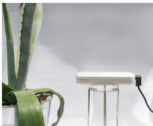
Tool for making colloidal silver solutions