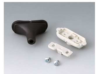
B2911329 Cable gland kit, 5.0 - 5.9 TPE black RAL 9005