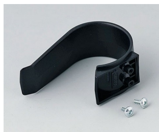
A9167029 Holding clamp PA 6 (UL 94 HB) black RAL 9005