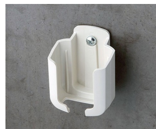
B2921507 Holder S ASA+PC (UL 94 V-0) off-white RAL 9002