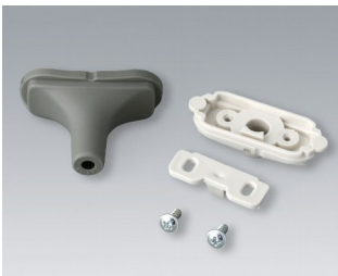
B2911318 Cable gland kit, 4.2 - 5.0 TPE volcano