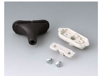
B2911329 Cable gland kit, 5.0 - 5.9 TPE black RAL 9005