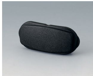
B2811209 End part ASA+PC (UL 94 V-0) black RAL 9005