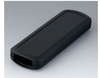
B2834109 CONNECT M ASA+PC (UL 94 V-0) black RAL 9005 156x54x22mm