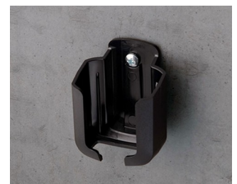
B2921509 Holder S ASA+PC (UL 94 V-0) black RAL 9005