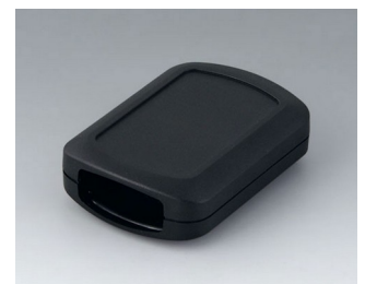
B2832109 CONNECT M ASA+PC (UL 94 V-0) black RAL 9005 76x54x22mm