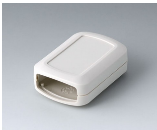
B2822107 CONNECT S ASA+PC (UL 94 V-0) off-white RAL 9002 60x42x22mm