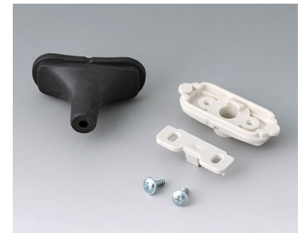
B2911309 Cable gland kit, 3.4 - 4.2 TPE black RAL 9005