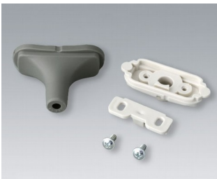
B2911318 Cable gland kit, 4.2 - 5.0 TPE volcano