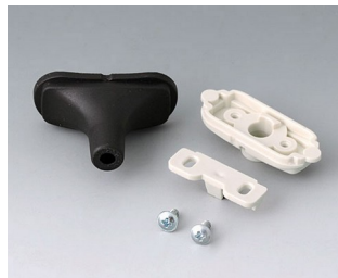
B2911319 Cable gland kit, 4.2 - 5.0 TPE black RAL 9005