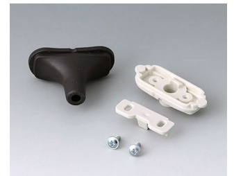
B2911329 Cable gland kit, 5.0 - 5.9 TPE black RAL 9005