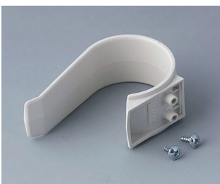
A9167027 Holding clamp PA 6 (UL 94 HB) off-white RAL 9002