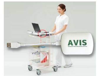
Receiver and data transfer for EMR