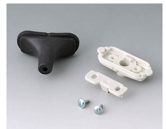
B2911309 Cable gland kit, 3.4 - 4.2 TPE black RAL 9005