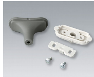
B2911308 Cable gland kit, 3.4 - 4.2 TPE volcano