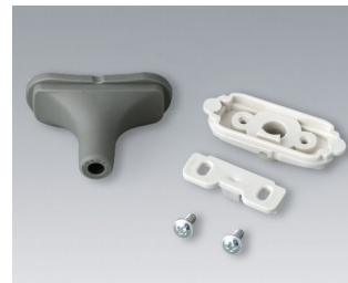
B2911328 Cable gland kit, 5.0 - 5.9 TPE volcano