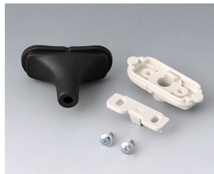
B2911319 Cable gland kit, 4.2 - 5.0 TPE black RAL 9005