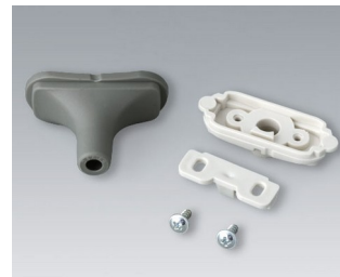
B2911328 Cable gland kit, 5.0 - 5.9 TPE volcano