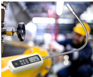
Gas leak detector