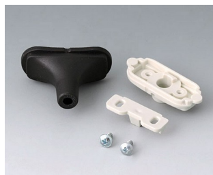
B2911319 Cable gland kit, 4.2 - 5.0 TPE black RAL 9005