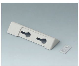
B4705207 Desktop stand set ASA+PC (UL 94 V-0)