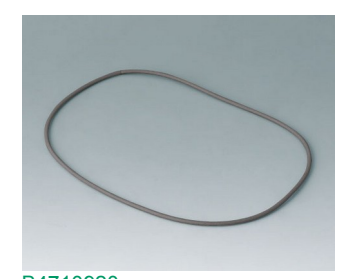
B4710920 Seal M