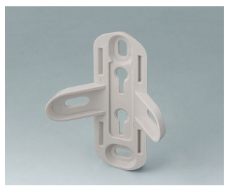
B4705907 Wall suspension element ASA+PC (UL 94 V-0)