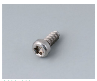
A0325060 Self-tapping screw 2.5 x 6 mm (T8) Stainless steel

Subject to technical modification without notice. © by OKW Gehäusesysteme, Buchen/Germany.