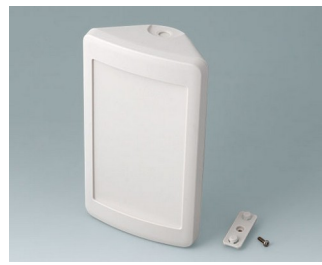
B4610207 SMART-CONTROL M, Vers. II ASA+PC (UL 94 V-0) off-white RAL 9002 173x101x59mm IP 55 opt., IP 40