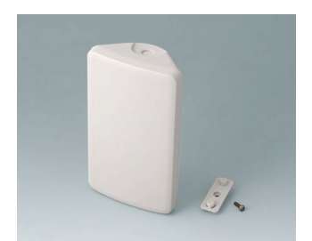
B4608107 SMART-CONTROL S, Vers. I ASA+PC (UL 94 V-0) off-white RAL 9002 142x81x46mm IP 55 opt., IP 40