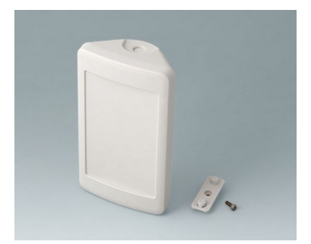
B4608207 SMART-CONTROL S, Vers. II ASA+PC (UL 94 V-0) off-white RAL 9002 142x81x46mm IP 55 opt., IP 40