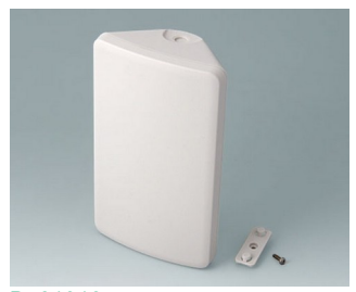
B4610107 SMART-CONTROL M, Vers. I ASA+PC (UL 94 V-0) off-white RAL 9002 173x101x59mm IP 55 opt., IP 40