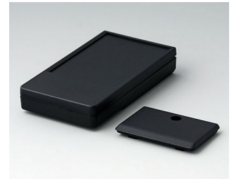
A9071219 DATEC-POCKET-BOX M PMMA (IR) (UL 94 HB) black RAL 9005 105x58x18.5mm IP 54