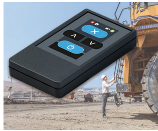
Radio transmitter for machines