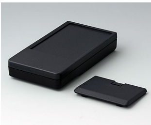
A9072229 DATEC-POCKET-BOX L PMMA (IR) (UL 94 HB) black RAL 9005 120x65x22mm IP 41