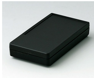
A9070219 DATEC-POCKET-BOX S PMMA (IR) (UL 94 HB) black RAL 9005 85x46x16mm IP 54