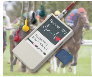
Telemetric ECG system for veterinary medicine