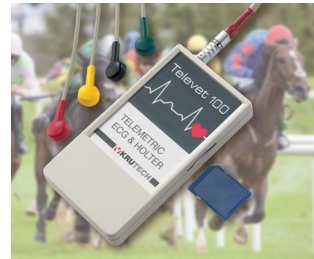
Telemetric ECG system for veterinary medicine