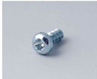
A0305031 Self-tapping screws 2.5 x 6 mm (PZ1)

Subject to technical modification without notice. © by OKW Gehäusesysteme, Buchen/Germany.