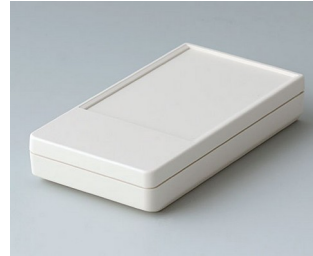
A9070117 DATEC-POCKET-BOX S ABS (UL 94 HB) off-white RAL 9002 85x46x16mm IP 54