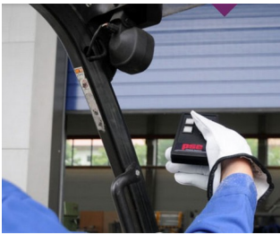
IR remote control for harsh environments