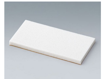
A9250251 Battery spacer PE foam 50x25x3mm