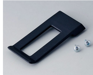
A9172109 Belt/Pocket clip ABS (UL 94 HB) black RAL 9005 62x30mm