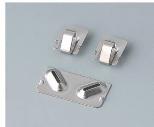
A9190003 Set of battery clips, 2xN/2xAA/2xAAA Steel nickel-plated