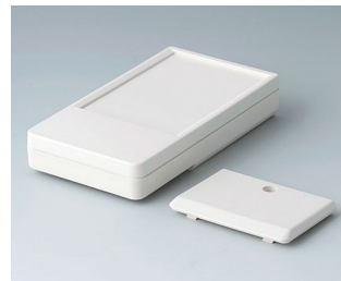
A9072117 DATEC-POCKET-BOX L ABS (UL 94 HB) off-white RAL 9002 120x65x22mm IP 54