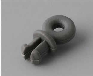
A9100001 Ring eyelet PA 6 volcano