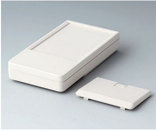
A9072127 DATEC-POCKET-BOX L ABS (UL 94 HB) off-white RAL 9002 120x65x22mm IP 41