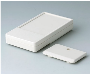
A9071117 DATEC-POCKET-BOX M ABS (UL 94 HB) off-white RAL 9002 105x58x18.5mm IP 54