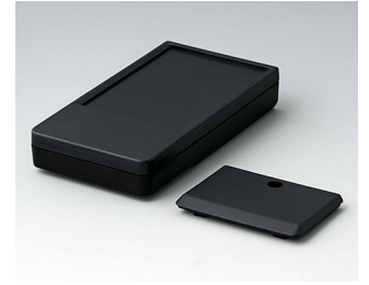
A9072219 DATEC-POCKET-BOX L PMMA (IR) (UL 94 HB) black RAL 9005 120x65x22mm IP 54