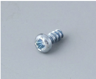
A0304031 Self-tapping screws 2.2 x 5 mm (PZ1)