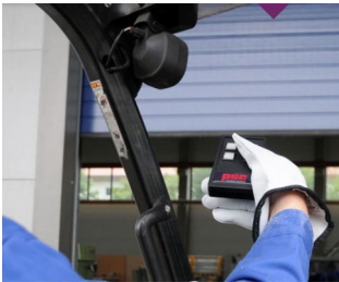
IR remote control for harsh environments