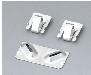
A9190002 Set of battery clips, 2xN/2xAA/2xAAA Steel tin-plated