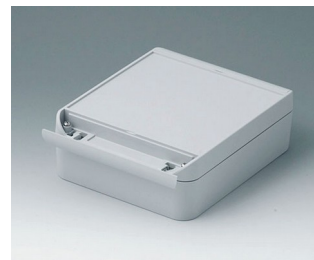
C6015181 SMART-BOX WIDTH 150 ASA+PC (UL 94 V-0) light grey RAL 7035 180x150x60mm IP 66