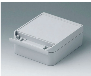
C6013161 SMART-BOX WIDTH 130 ASA+PC (UL 94 V-0) light grey RAL 7035 160x130x60mm IP 66