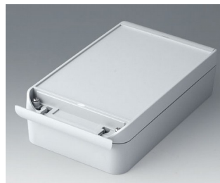
C6013221 SMART-BOX WIDTH 130 ASA+PC (UL 94 V-0) light grey RAL 7035 220x130x60mm IP 66