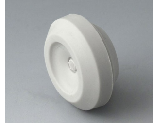
C2316147 Cable grommet TPE light grey RAL 7035 IP 67