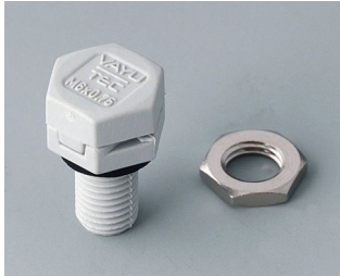
C2306917 Pressure equalisation element M6x0.75 PA 6 (UL 94 HB) light grey RAL 7035 IP 56