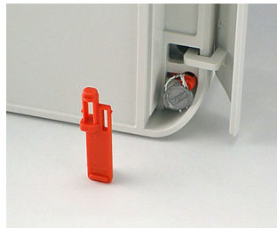
C6100006 Security plug PA 6 red