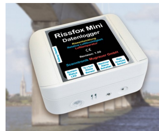
Miniature data logger for crack displacements and climatic data