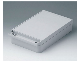
C6017281 SMART-BOX WIDTH 170 ASA+PC (UL 94 V-0) light grey RAL 7035 280x170x60mm IP 65