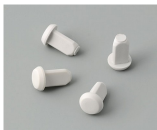
C2299018 Case feet TPE (UL 94 HB)