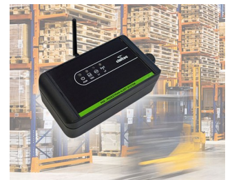
Pedestrian Alert System