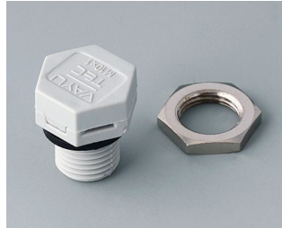
C2310917 Pressure equalisation element M10x1 PA 6 (UL 94 HB) light grey RAL 7035 IP 56