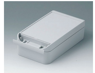
C6011201 SMART-BOX WIDTH 110 ASA+PC (UL 94 V-0) light grey RAL 7035 200x110x60mm IP 66