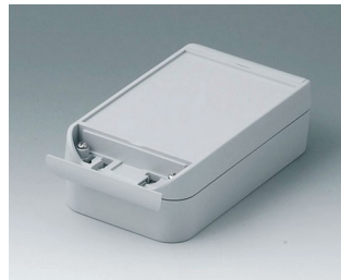
C6009161 SMART-BOX WIDTH 90 ASA+PC (UL 94 V-0) light grey RAL 7035 160x90x50mm IP 66