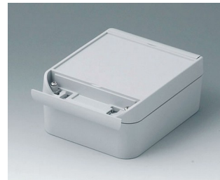
C6011141 SMART-BOX WIDTH 110 ASA+PC (UL 94 V-0) light grey RAL 7035 140x110x60mm IP 66