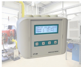
Universal temperature controller / Temperature difference controller