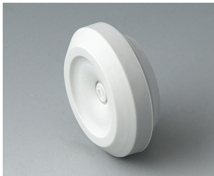
C2320147 Cable grommet TPE light grey RAL 7035 IP 67