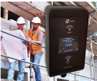
RFID card reader for construction site workers