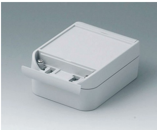
C6009121 SMART-BOX WIDTH 90 ASA+PC (UL 94 V-0) light grey RAL 7035 120x90x50mm IP 66