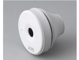
C2320137 Cable grommet EPDM light grey RAL 7035 IP 67