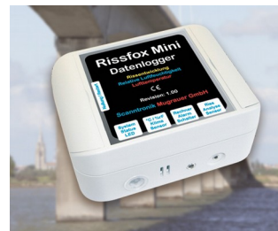
Miniature data logger for crack displacements and climatic data