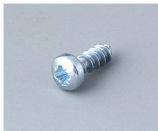
A0308031 Self-tapping screws 3 x 8 mm (PZ1)