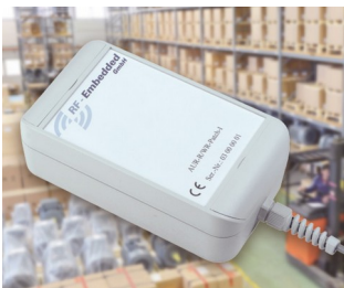
Active UHF RFID system