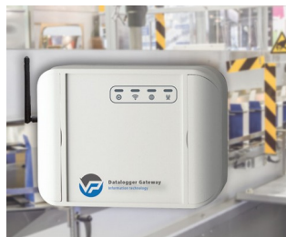
Data logger for machine monitoring