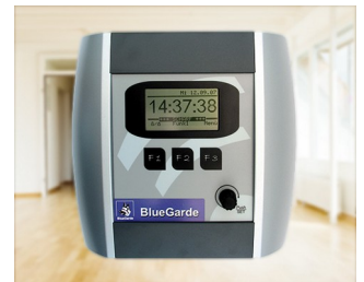
House control unit