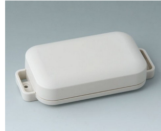
C3206107 EASYTEC 100 ASA+PC (UL 94 V-0) off-white RAL 9002 121x62x26mm IP 65 opt., IP 40