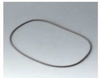
A9504030 Sealing 150