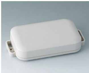
C3207107 EASYTEC 125 ASA+PC (UL 94 V-0) off-white RAL 9002 147x78x30mm IP 65 opt., IP 40