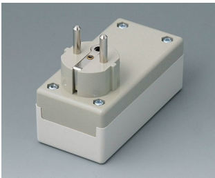
A9011665 PLUG CASE F / D, Vers. I PC+ABS (UL 94 V-0) off-white RAL 9002 100x50x40mm