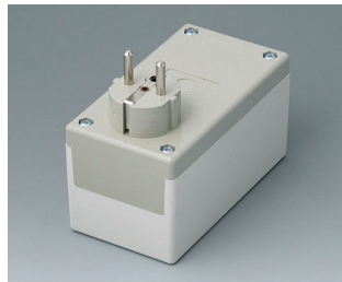
A9021665 PLUG CASE F / D, Vers. I PC+ABS (UL 94 V-0) pebble grey RAL 7032 120x65x65mm