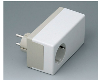
A9022465 PLUG CASE D, Vers. II PC+ABS (UL 94 V-0) pebble grey RAL 7032 120x65x55mm