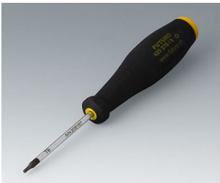
A0399T06 Torx T6 screwdriver