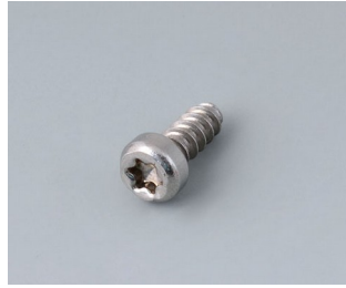
A0325060 Self-tapping screw 2.5 x 6 mm (T8) Stainless steel