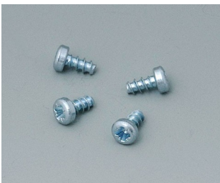
B5111201 Set of screws