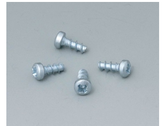
A9199008 Set of screws