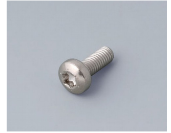
A0330080 Screw M3 x 8 mm (T10) Stainless steel