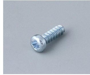
A0325080 Self-tapping screws 2.5 x 8 mm (PZ1)