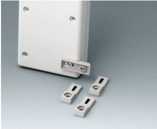
A9204108 Wall mounting brackets PA 6 pebble grey RAL 7032