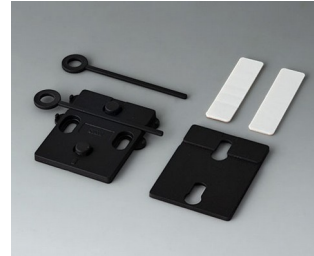
A9305019 Wall suspension elements ASA+PC (UL 94 V-0) black RAL 9005