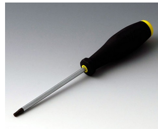
A0399T20 Torx T20 screwdriver