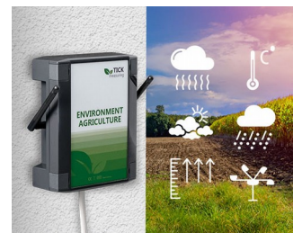
Weather station in agriculture