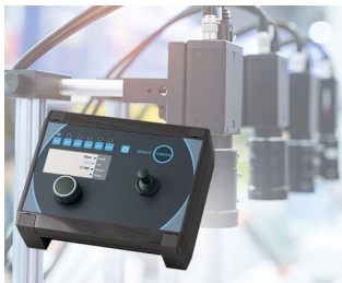
Camera control in production