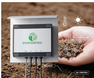
Smart Farming - system for long-term measurements