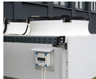
Heating/air conditioning/ventilation control