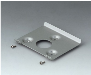
B4514101 Wall suspension element 140 Aluminium