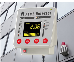
Terminal for fire alarm systems