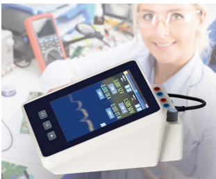
Multimeter measuring device