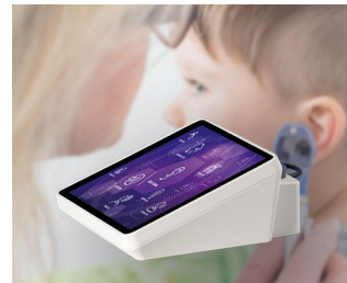
Hearing test device