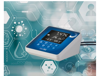
Laboratory measuring device