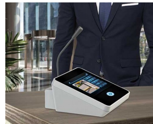
Table microphone / inter phone