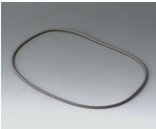
B4514030 Sealing 140