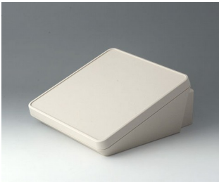
B4422307 PROTEC 220, Vers. III ASA+PC (UL 94 V-0) off-white RAL 9002 220x243x108mm IP 65 opt.