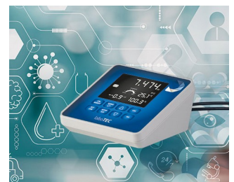
Laboratory measuring device