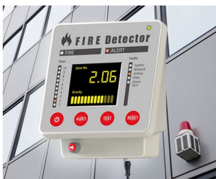
Terminal for fire alarm systems