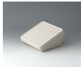
B4414307 PROTEC 140, Vers. III ASA+PC (UL 94 V-0) off-white RAL 9002 140x160x76mm IP 65 opt.