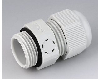
C2320917 Cable gland M20x1.5, pressure compensation PA light grey RAL 7035 IP 68