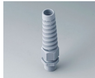
C2320528 Cable gland M20x1.5, bending protection PA silver grey RAL 7001