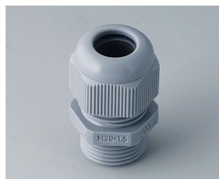
C2320418 Cable gland M20x1.5 PA silver grey RAL 7001