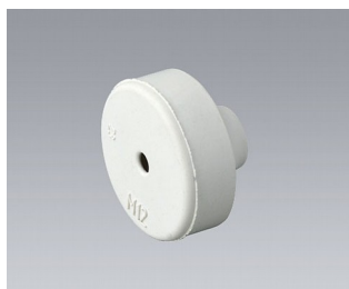
C2312137 Cable grommet EPDM light grey RAL 7035