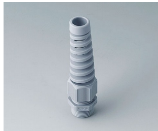
C2320518 Cable gland M20x1.5, bending protection PA silver grey RAL 7001