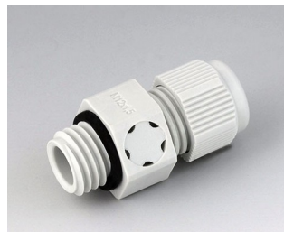
C2312917 Cable gland M12x1.5, pressure compensation PA light grey RAL 7035