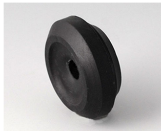
C2320159 Cable grommet TPE (UL 94 V-0) black RAL 9005