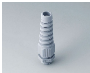
C2316518 Cable gland M16x1.5, bending protection PA silver grey RAL 7001