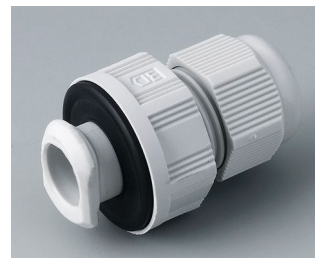
C2316717 Quick fix cable gland, M16 PA light grey RAL 7035