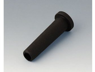
C2353849 Flexible cable grommet Ø 5,3 black