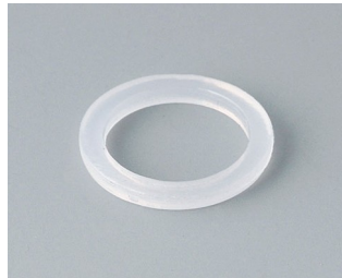
C2312126 Sealing ring for external thread M12x1.5 PE natural-coloured