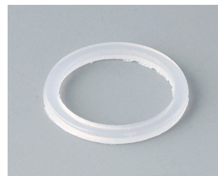
C2316126 Sealing ring for external thread M16x1.5 PE natural-coloured