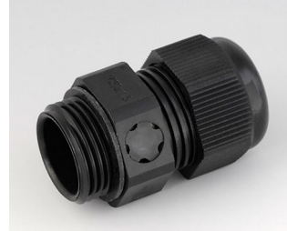
C2320919 Cable gland M20x1.5, pressure compensation PA black RAL 9005 IP 68