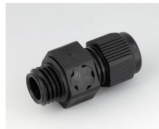
C2312919 Cable gland M12x1.5, pressure compensation PA black RAL 9005