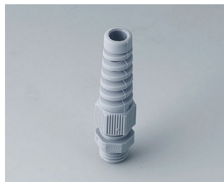
C2312518 Cable gland M12x1.5, bending protection PA silver grey RAL 7001