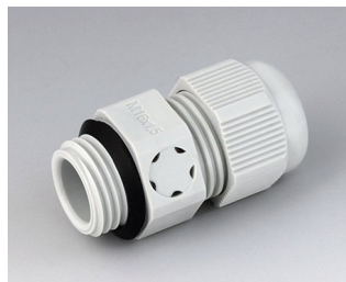
C2316917 Cable gland M16x1.5, pressure compensation PA light grey RAL 7035