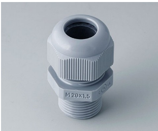
C2320428 Cable gland M20x1.5 PA silver grey RAL 7001