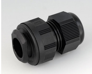
C2320719 Quick fix cable gland, M20 PA black RAL 9005 IP 68