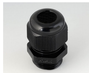
C2320419 Cable gland M20x1.5 PA black RAL 9005