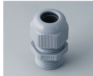
C2320418 Cable gland M20x1.5 PA silver grey RAL 7001