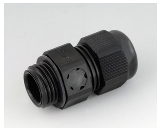
C2316919 Cable gland M16x1.5, pressure compensation PA black RAL 9005