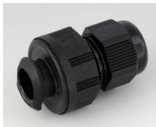
C2316719 Quick fix cable gland, M16 PA black RAL 9005