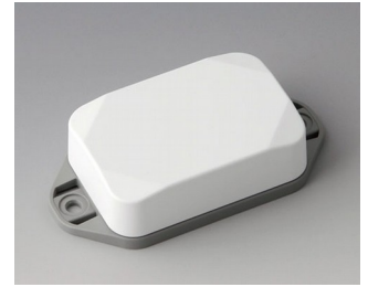
B1822226 MINI-DATA-BOX EF40, high, with flanges ASA+PC (UL 94 V-0) traffic white RAL 9016 60x40x20mm IP 65 opt., IP 40