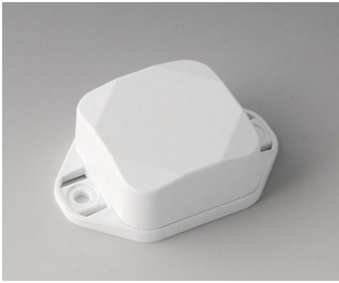
B1802227 MINI-DATA-BOX SF40, high, with flanges ASA+PC (UL 94 V-0) traffic white RAL 9016 40x40x20mm IP 65 opt., IP 40