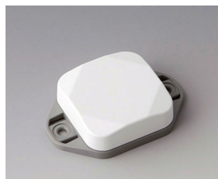
B1802126 MINI-DATA-BOX SF40, flat, with flanges ASA+PC (UL 94 V-0) traffic white RAL 9016 40x40x15mm IP 65 opt., IP 40