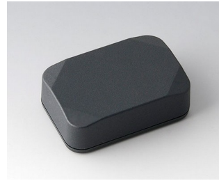
B1822218 MINI-DATA-BOX E40, high ASA+PC (UL 94 V-0) anthracite grey RAL 7016 60x40x20mm IP 65 opt., IP 40