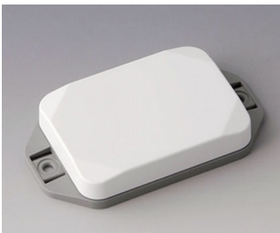
B1824126 MINI-DATA-BOX EF50, flat, with flanges ASA+PC (UL 94 V-0) traffic white RAL 9016 70x50x15mm IP 65 opt., IP 40