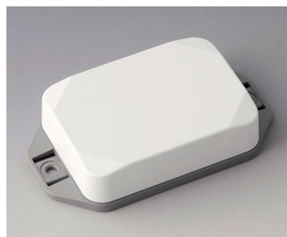
B1824226 MINI-DATA-BOX EF50, high, with flanges ASA+PC (UL 94 V-0) traffic white RAL 9016 70x50x20mm IP 65 opt., IP 40