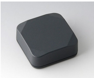
B1804218 MINI-DATA-BOX S50, high ASA+PC (UL 94 V-0) anthracite grey RAL 7016 50x50x20mm IP 65 opt., IP 40