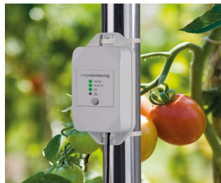
Data logger crop management