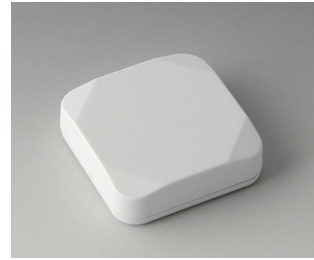
B1804117 MINI-DATA-BOX S50, flat ASA+PC (UL 94 V-0) traffic white RAL 9016 50x50x15mm IP 65 opt., IP 40