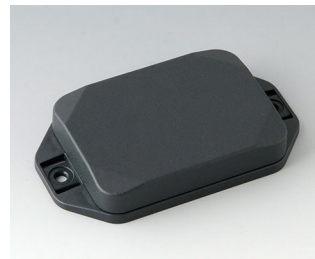
B1824128 MINI-DATA-BOX EF50, flat, with flanges ASA+PC (UL 94 V-0) anthracite grey RAL 7016 70x50x15mm IP 65 opt., IP 40