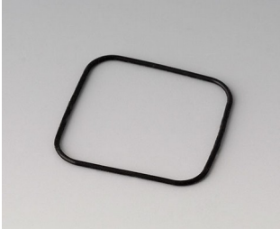
B1902101 Sealing S40/SF40