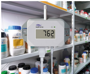
Gas detector for hazardous substances