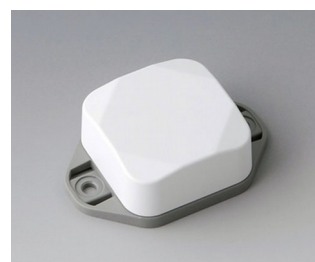
B1802226 MINI-DATA-BOX SF40, high, with flanges ASA+PC (UL 94 V-0) traffic white RAL 9016 40x40x20mm IP 65 opt., IP 40