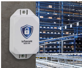
Access authorization of transponders