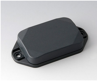
B1822128 MINI-DATA-BOX EF40, flat, with flanges ASA+PC (UL 94 V-0) anthracite grey RAL 7016 60x40x15mm IP 65 opt., IP 40