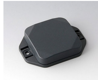
B1804128 MINI-DATA-BOX SF50, flat, with flanges ASA+PC (UL 94 V-0) anthracite grey RAL 7016 50x50x15mm IP 65 opt., IP 40