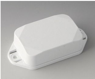
B1822227 MINI-DATA-BOX EF40, high, with flanges ASA+PC (UL 94 V-0) traffic white RAL 9016 60x40x20mm IP 65 opt., IP 40