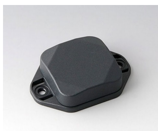
B1802128 MINI-DATA-BOX SF40, flat, with flanges ASA+PC (UL 94 V-0) anthracite grey RAL 7016 40x40x15mm IP 65 opt., IP 40