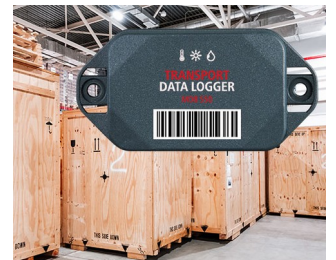
Data logger in transportation