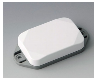
B1822126 MINI-DATA-BOX EF40, flat, with flanges ASA+PC (UL 94 V-0) traffic white RAL 9016 60x40x15mm IP 65 opt., IP 40