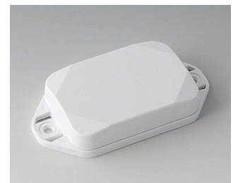
B1822127 MINI-DATA-BOX EF40, flat, with flanges ASA+PC (UL 94 V-0) traffic white RAL 9016 60x40x15mm IP 65 opt., IP 40