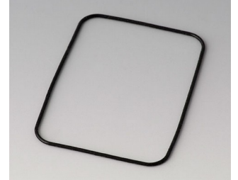
B1924101 Sealing E50/EF50