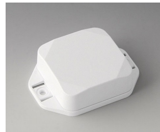
B1804227 MINI-DATA-BOX SF50, high, with flanges ASA+PC (UL 94 V-0) traffic white RAL 9016 50x50x20mm IP 65 opt., IP 40