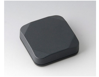
B1804118 MINI-DATA-BOX S50, flat ASA+PC (UL 94 V-0) anthracite grey RAL 7016 50x50x15mm IP 65 opt., IP 40