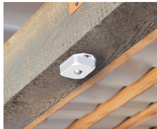
Motion detector with sensor for automatic control