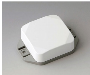
B1804226 MINI-DATA-BOX SF50, high, with flanges ASA+PC (UL 94 V-0) traffic white RAL 9016 50x50x20mm IP 65 opt., IP 40