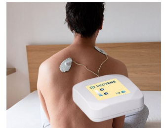
TENS device for pain therapy