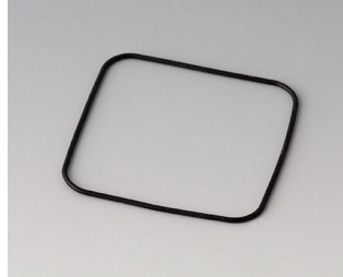
B1904101 Sealing S50/SF50