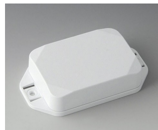
B1824227 MINI-DATA-BOX EF50, high, with flanges ASA+PC (UL 94 V-0) traffic white RAL 9016 70x50x20mm IP 65 opt., IP 40