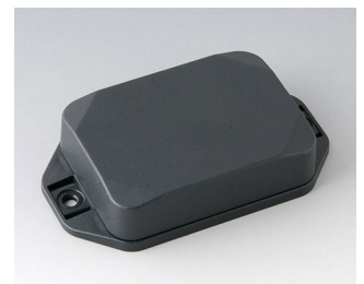
B1824228 MINI-DATA-BOX EF50, high, with flanges ASA+PC (UL 94 V-0) anthracite grey RAL 7016 70x50x20mm IP 65 opt., IP 40