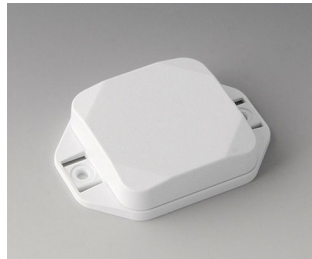
B1804127 MINI-DATA-BOX SF50, flat, with flanges ASA+PC (UL 94 V-0) traffic white RAL 9016 50x50x15mm IP 65 opt., IP 40