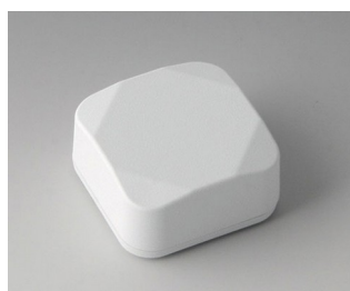
B1802217 MINI-DATA-BOX S40, high ASA+PC (UL 94 V-0) traffic white RAL 9016 40x40x20mm IP 65 opt., IP 40