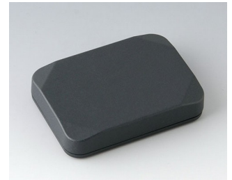
B1824118 MINI-DATA-BOX E50, flat ASA+PC (UL 94 V-0) anthracite grey RAL 7016 70x50x15mm IP 65 opt., IP 40