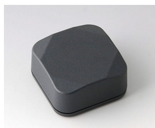
B1802218 MINI-DATA-BOX S40, high ASA+PC (UL 94 V-0) anthracite grey RAL 7016 40x40x20mm IP 65 opt., IP 40