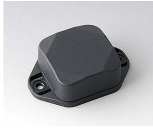
B1802228 MINI-DATA-BOX SF40, high, with flanges ASA+PC (UL 94 V-0) anthracite grey RAL 7016 40x40x20mm IP 65 opt., IP 40