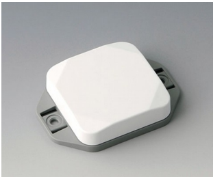
B1804126 MINI-DATA-BOX SF50, flat, with flanges ASA+PC (UL 94 V-0) traffic white RAL 9016 50x50x15mm IP 65 opt., IP 40