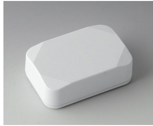
B1822217 MINI-DATA-BOX E40, high ASA+PC (UL 94 V-0) traffic white RAL 9016 60x40x20mm IP 65 opt., IP 40