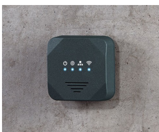
Wireless Access Point