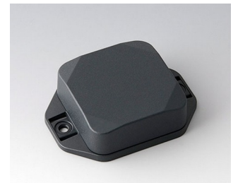
B1804228 MINI-DATA-BOX SF50, high, with flanges ASA+PC (UL 94 V-0) anthracite grey RAL 7016 50x50x20mm IP 65 opt., IP 40