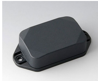
B1822228 MINI-DATA-BOX EF40, high, with flanges ASA+PC (UL 94 V-0) anthracite grey RAL 7016 60x40x20mm IP 65 opt., IP 40