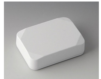
B1824217 MINI-DATA-BOX E50, high ASA+PC (UL 94 V-0) traffic white RAL 9016 70x50x20mm IP 65 opt., IP 40