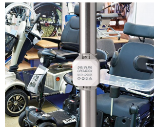
Data logger for Driving Operations