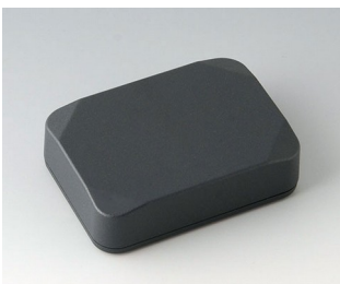
B1824218 MINI-DATA-BOX E50, high ASA+PC (UL 94 V-0) anthracite grey RAL 7016 70x50x20mm IP 65 opt., IP 40