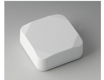
B1804217 MINI-DATA-BOX S50, high ASA+PC (UL 94 V-0) traffic white RAL 9016 50x50x20mm IP 65 opt., IP 40