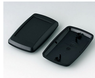
B9006806 Bottom and top part EL PMMA (IR) (UL 94 HB) black RAL 9005 78x48x20mm