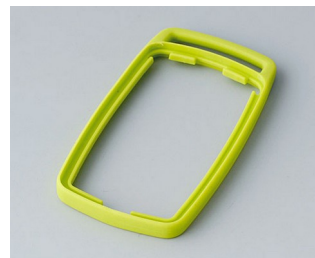
B9002704 Intermediate ring ES TPE green