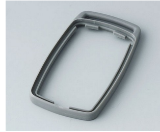
B9002708 Intermediate ring ES TPE volcano