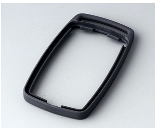
B9002702 Intermediate ring ES TPE lava