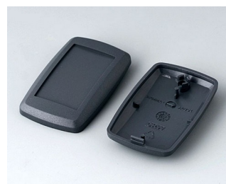
B9002808 Bottom and top part ES ABS (UL 94 HB) lava 52x32x15mm