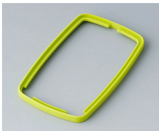
B9006784 Intermediate ring EL SEBS (TPE) green