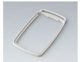
B9006707 Intermediate ring EL SEBS (TPE) off-white RAL 9002