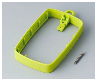
B9004784 Intermediate ring EM, high SEBS (TPE) green