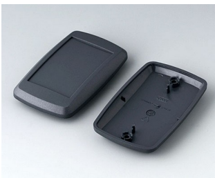
B9006808 Bottom and top part EL ABS (UL 94 HB) lava 78x48x20mm