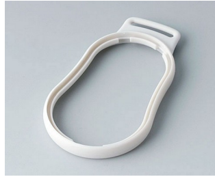
B9004307 Intermediate ring DM SEBS (TPE) off-white RAL 9002