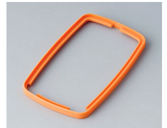
B9006783 Intermediate ring EL TPE orange