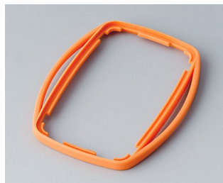
B9004753 Intermediate ring EM SEBS (TPE) orange