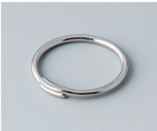
A9164001 Key ring Steel nickel-plated 20.5mm