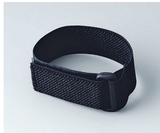
B9100033 Wrist strap black 280mm