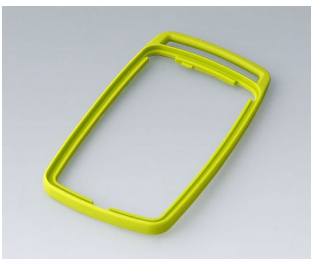
B9006704 Intermediate ring EL SEBS (TPE) green