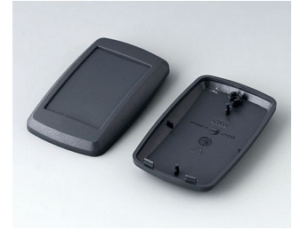
B9004808 Bottom and top part EM ABS (UL 94 HB) lava 68x42x18mm