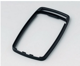
B9004706 Intermediate ring EM PMMA (IR) (UL 94 HB) black RAL 9005