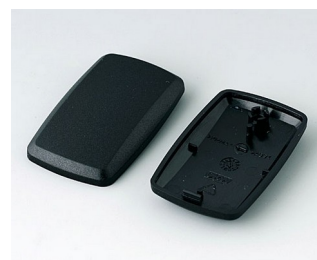
B9002856 Bottom and top part ES PMMA (IR) (UL 94 HB) black RAL 9005 52x32x15mm