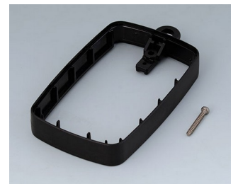
B9004786 Intermediate ring EM, high PMMA (IR) (UL 94 HB) black RAL 9005