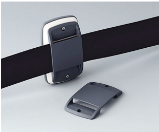
B9106108 Strap eyelet EL ABS (UL 94 HB) lava