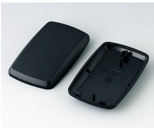
B9004856 Bottom and top part EM PMMA (IR) (UL 94 HB) black RAL 9005 68x42x18mm