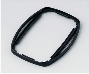
B9004756 Intermediate ring EM PMMA (IR) (UL 94 HB) black RAL 9005