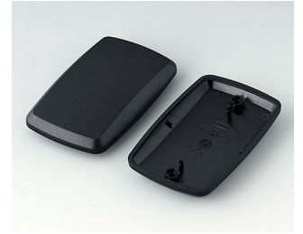
B9006856 Bottom and top part EL PMMA (IR) (UL 94 HB) black RAL 9005 78x48x20mm