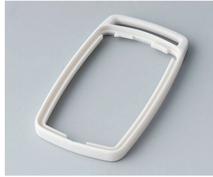
B9002707 Intermediate ring ES TPE off-white RAL 9002