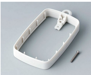
B9004787 Intermediate ring EM, high SEBS (TPE) off-white RAL 9002