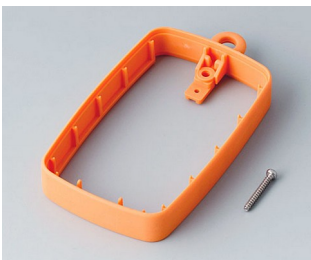
B9004783 Intermediate ring EM, high TPE orange