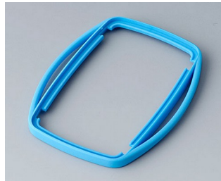
B9006755 Intermediate ring EL TPE blue