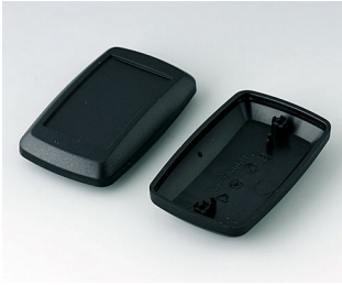
B9006826 Bottom and top part EL PMMA (IR) (UL 94 HB) black RAL 9005 78x48x26mm