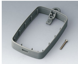
B9004778 Intermediate ring EM, Micro USB 5 P, B Type SMT SEBS (TPE) volcano