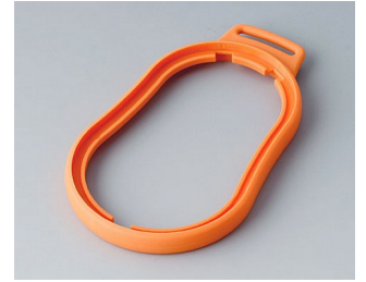
B9006303 Intermediate ring DL TPE orange