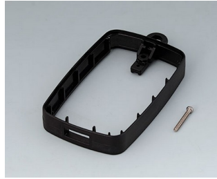
B9004799 Intermediate ring EM, USB type A ABS (UL 94 HB) black RAL 9005