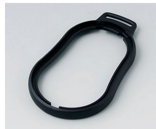
B9006306 Intermediate ring DL PMMA (IR) (UL 94 HB) black RAL 9005