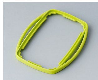
B9004754 Intermediate ring EM TPE green