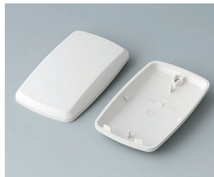
B9004857 Bottom and top part EM ABS (UL 94 HB) off-white RAL 9002 68x42x18mm