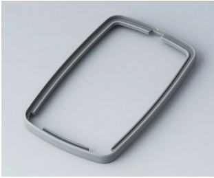
B9006788 Intermediate ring EL TPE volcano