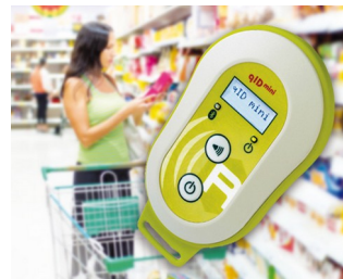
Mobile UHF RFID scanner