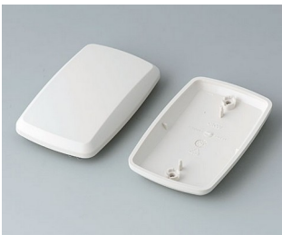
B9006857 Bottom and top part EL ABS (UL 94 HB) off-white RAL 9002 78x48x20mm