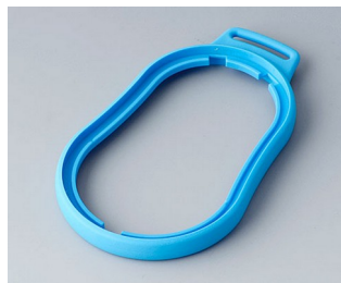
B9006305 Intermediate ring DL TPE blue