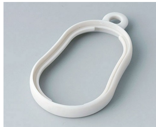
B9002357 Intermediate ring DS SEBS (TPE) off-white RAL 9002