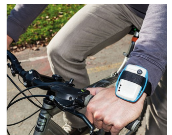
Mobile air quality monitoring