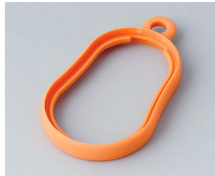
B9002353 Intermediate ring DS TPE orange