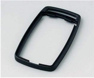
B9002706 Intermediate ring ES PMMA (IR) (UL 94 HB) black RAL 9005