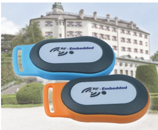
Mobile RFID information system