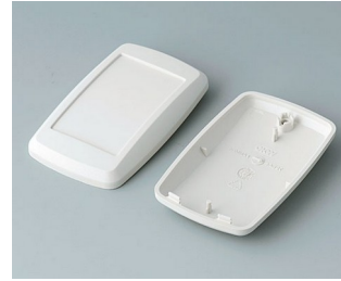
B9004807 Bottom and top part EM ABS (UL 94 HB) off-white RAL 9002 68x42x18mm