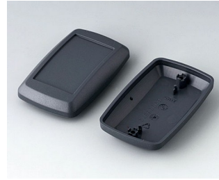
B9006828 Bottom and top part EL ABS (UL 94 HB) lava 78x48x26mm