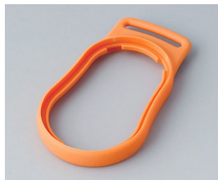
B9002303 Intermediate ring DS SEBS (TPE) orange