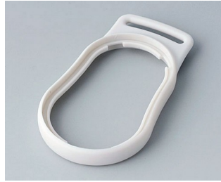
B9002307 Intermediate ring DS SEBS (TPE) off-white RAL 9002