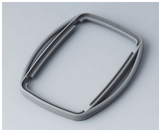
B9006758 Intermediate ring EL TPE volcano