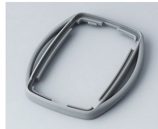
B9002758 Intermediate ring ES TPE volcano