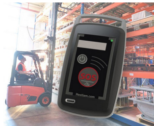
Mobile Security Solutions for workers