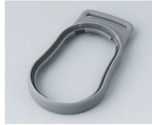
B9002308 Intermediate ring DS TPE volcano