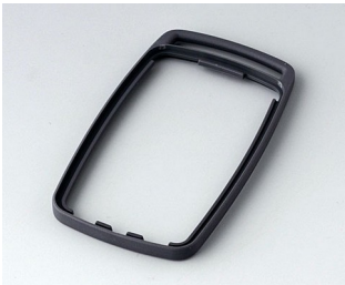
B9004702 Intermediate ring EM TPE lava