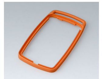
B9006703 Intermediate ring EL TPE orange