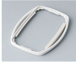
B9004757 Intermediate ring EM SEBS (TPE) off-white RAL 9002