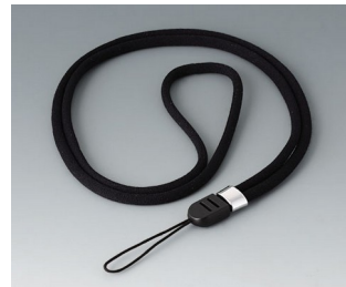
B9100063 Carrying strap, textile lanyard black 860mm