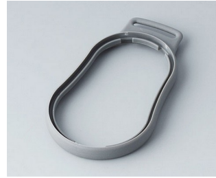
B9004308 Intermediate ring DM TPE volcano