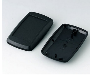
B9004806 Bottom and top part EM PMMA (IR) (UL 94 HB) black RAL 9005 68x42x18mm