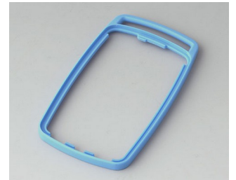
B9004705 Intermediate ring EM TPE blue