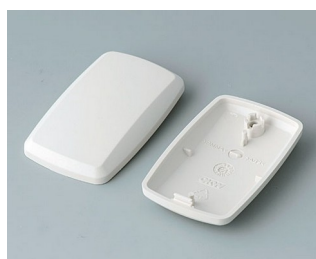
B9002857 Bottom and top part ES ABS (UL 94 HB) off-white RAL 9002 52x32x15mm