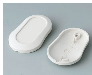
B9002907 Bottom and top part DS ABS (UL 94 HB) off-white RAL 9002 51x32x13mm