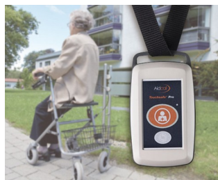
Radio transmitter for emergency call system for patients