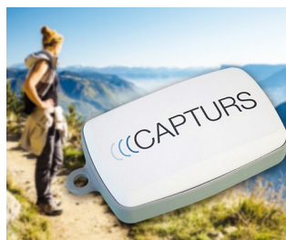
GPS tracking in real time