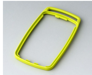
B9004704 Intermediate ring EM TPE green