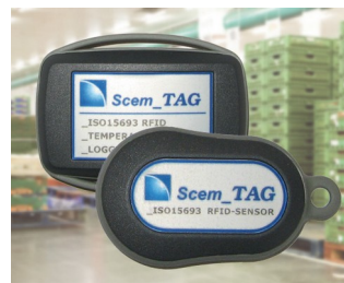
RFID sensor transponder and data logger