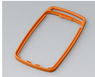
B9004703 Intermediate ring EM TPE orange