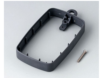
B9004782 Intermediate ring EM, high SEBS (TPE) lava