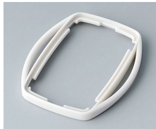
B9002757 Intermediate ring ES TPE off-white RAL 9002