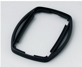
B9002756 Intermediate ring ES PMMA (IR) (UL 94 HB) black RAL 9005