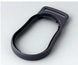
B9002302 Intermediate ring DS TPE lava