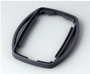
B9002752 Intermediate ring ES TPE lava