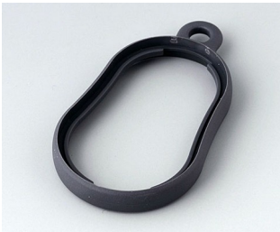
B9002352 Intermediate ring DS TPE lava