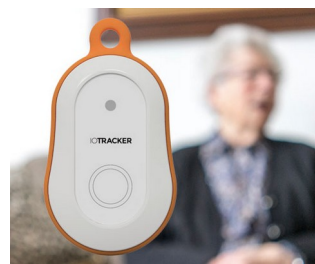
LoRa GPS tracker with alarm button