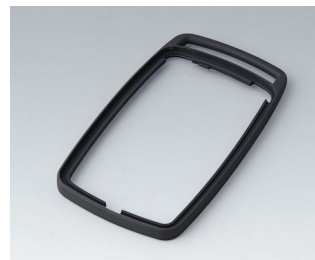
B9006702 Intermediate ring EL TPE lava