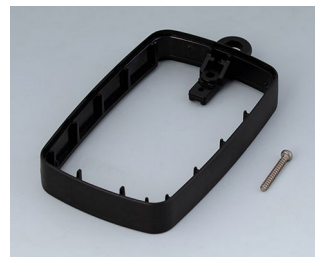
B9004789 Intermediate ring EM, high ABS (UL 94 HB) black RAL 9005