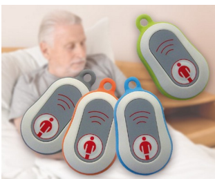
Radio paging systems