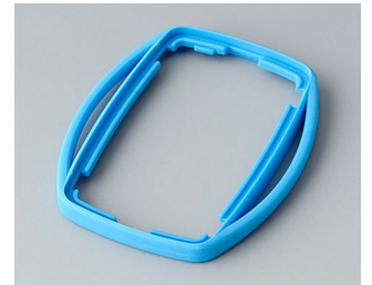
B9002755 Intermediate ring ES TPE blue