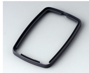
B9006782 Intermediate ring EL SEBS (TPE) lava