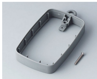
B9004788 Intermediate ring EM, high TPE volcano