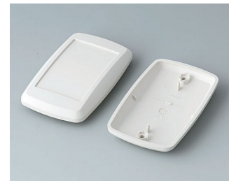
B9006807 Bottom and top part EL ABS (UL 94 HB) off-white RAL 9002 78x48x20mm