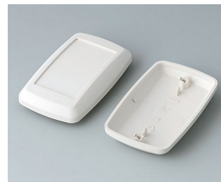
B9006817 Bottom and top part EL ABS (UL 94 HB) off-white RAL 9002 78x48x24mm