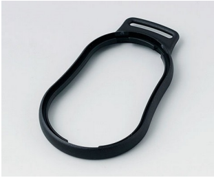
B9004306 Intermediate ring DM PMMA (IR) (UL 94 HB) black RAL 9005