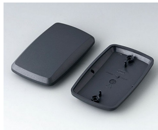
B9006858 Bottom and top part EL ABS (UL 94 HB) lava 78x48x20mm