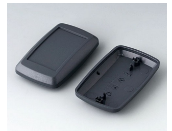
B9006818 Bottom and top part EL ABS (UL 94 HB) lava 78x48x24mm