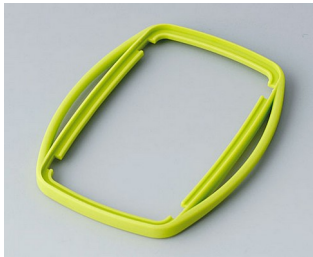
B9006754 Intermediate ring EL SEBS (TPE) green