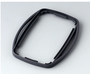
B9004752 Intermediate ring EM TPE lava