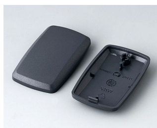
B9002858 Bottom and top part ES ABS (UL 94 HB) lava 52x32x15mm