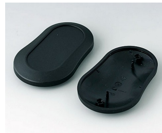
B9006906 Bottom and top part DL PMMA (IR) (UL 94 HB) black RAL 9005 84x53x19mm