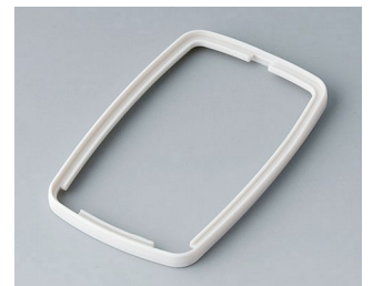
B9006787 Intermediate ring EL SEBS (TPE) off-white RAL 9002