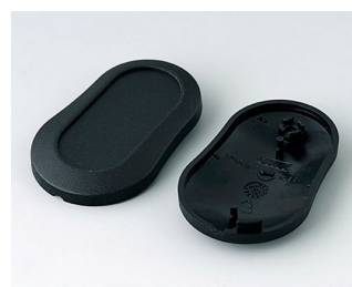
B9002906 Bottom and top part DS PMMA (IR) (UL 94 HB) black RAL 9005 51x32x13mm