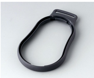
B9004302 Intermediate ring DM TPE lava