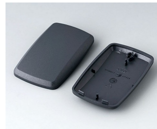
B9004858 Bottom and top part EM ABS (UL 94 HB) lava 68x42x18mm