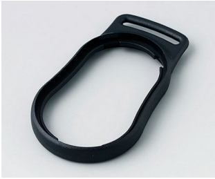
B9002306 Intermediate ring DS PMMA (IR) (UL 94 HB) black RAL 9005