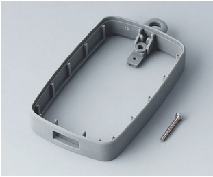
B9004798 Intermediate ring EM, USB type A SEBS (TPE) volcano