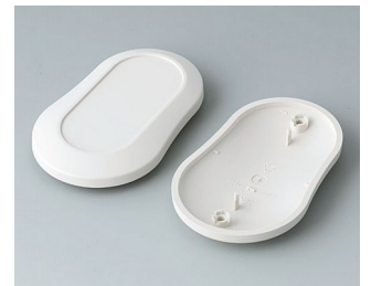
B9006907 Bottom and top part DL ABS (UL 94 HB) off-white RAL 9002 84x53x19mm