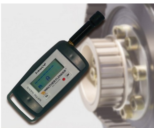
Tension meter for measuring belt pretension