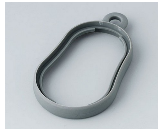
B9002358 Intermediate ring DS TPE volcano