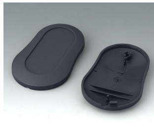
B9004908 Bottom and top part DM ABS (UL 94 HB) lava 70x44x16mm