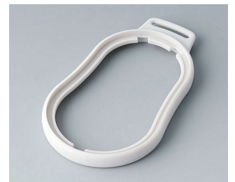
B9006307 Intermediate ring DL SEBS (TPE) off-white RAL 9002