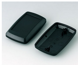
B9006816 Bottom and top part EL PMMA (IR) (UL 94 HB) black RAL 9005 78x48x24mm