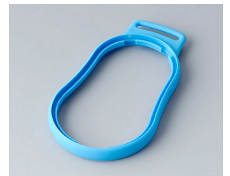
B9004305 Intermediate ring DM TPE blue