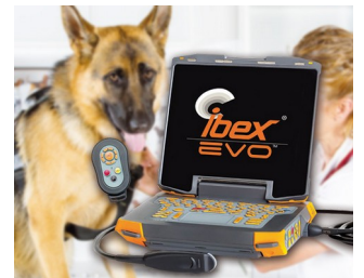
Portable ultrasonic device for veterinary medicine