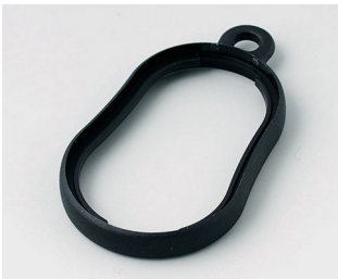
B9002356 Intermediate ring DS PMMA (IR) (UL 94 HB) black RAL 9005