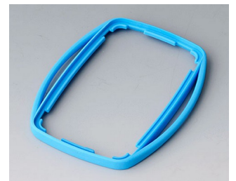
B9004755 Intermediate Ring EM TPE blue