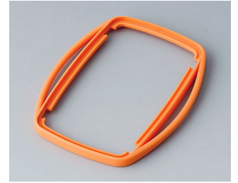
B9006753 Intermediate ring EL TPE orange