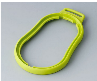
B9006304 Intermediate ring DL TPE green