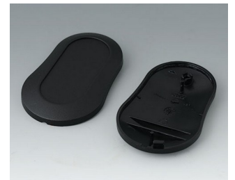
B9004906 Bottom and top part DM PMMA (IR) (UL 94 HB) black RAL 9005 70x44x16mm