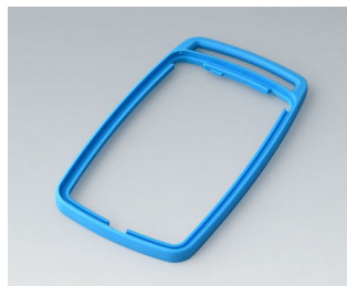
B9006705 Intermediate ring EL TPE blue