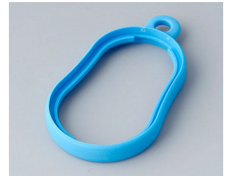
B9002355 Intermediate ring DS TPE blue