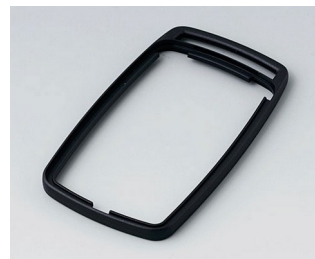
B9006706 Intermediate ring EL PMMA (IR) (UL 94 HB) black RAL 9005