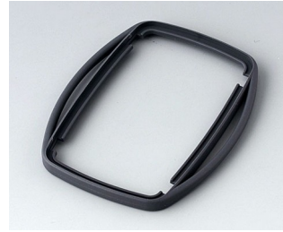
B9006752 Intermediate ring EL TPE lava