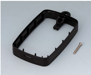
B9004776 Intermediate ring EM, Micro USB 5 P, B Type SMT PMMA (IR) (UL 94 HB) black RAL 9005