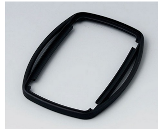
B9006756 Intermediate ring EL PMMA (IR) (UL 94 HB) black RAL 9005