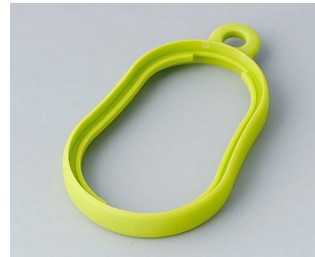
B9002354 Intermediate ring DS TPE green