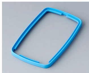
B9006785 Intermediate ring EL TPE blue