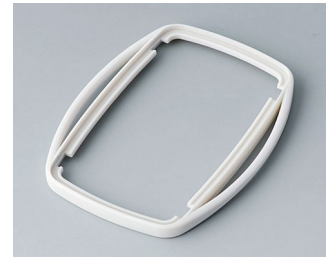
B9006757 Intermediate ring EL SEBS (TPE) off-white RAL 9002