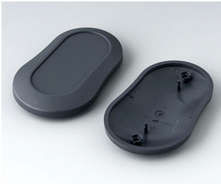
B9006908 Bottom and top part DL ABS (UL 94 HB) lava 84x53x19mm