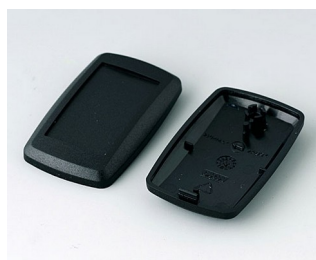
B9002806 Bottom and top part ES PMMA (IR) (UL 94 HB) black RAL 9005 52x32x15mm