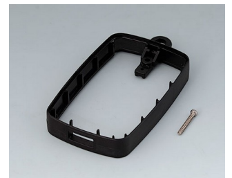
B9004796 Intermediate ring EM, USB type A PMMA (IR) (UL 94 HB) black RAL 9005