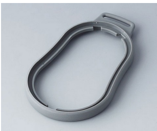
B9006308 Intermediate ring DL TPE volcano