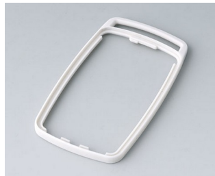
B9004707 Intermediate ring EM TPE off-white RAL 9002