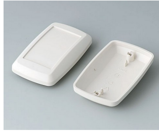
B9006827 Bottom and top part EL ABS (UL 94 HB) off-white RAL 9002 78x48x26mm