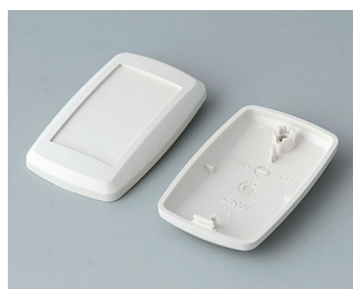
B9002807 Bottom and top part ES ABS (UL 94 HB) off-white RAL 9002 52x32x15mm