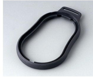
B9006302 Intermediate ring DL TPE lava