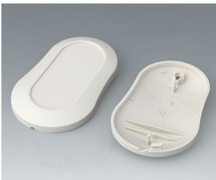
B9004907 Bottom and top part DM ABS (UL 94 HB) off-white RAL 9002 70x44x16mm