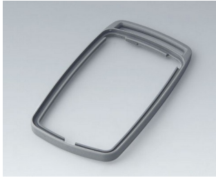
B9006708 Intermediate ring EL TPE volcano