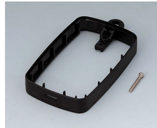
B9004779 Intermediate ring EM, Micro USB 5 P, B Type SMT ABS (UL 94 HB) black RAL 9005