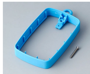
B9004785 Intermediate ring EM, high TPE blue