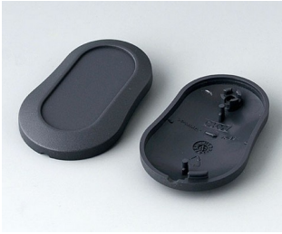
B9002908 Bottom and top part DS ABS (UL 94 HB) lava 51x32x13mm