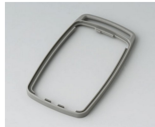
B9004708 Intermediate ring EM TPE volcano