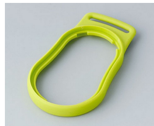
B9002304 Intermediate ring DS SEBS (TPE) green