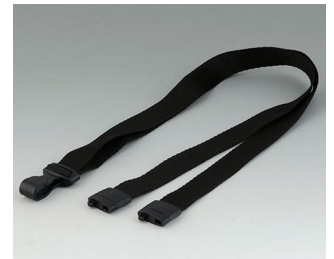
B9100073 Carrying strap, textile lanyard black 914x16mm