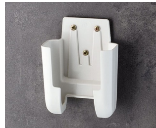
A9106627 Holder M ASA+PC (UL 94 V-0) off-white RAL 9002