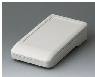
A9005117 DATEC-COMPACT S ASA+PC (UL 94 V-0) off-white RAL 9002 136x74x32mm IP 41