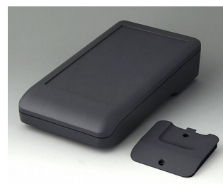
A9007218 DATEC-COMPACT L ASA+PC (UL 94 V-0) lava 206x110x47mm IP 41