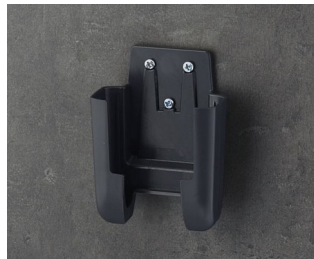
A9105628 Holder S ASA+PC (UL 94 V-0) lava