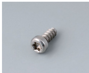
A0325060 Self-tapping screw 2.5 x 6 mm (T8) Stainless steel