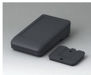
A9005218 DATEC-COMPACT S ASA+PC (UL 94 V-0) lava 136x74x32mm IP 41