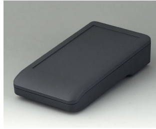
A9006108 DATEC-COMPACT M ASA+PC (UL 94 V-0) lava 172x92x39mm IP 65