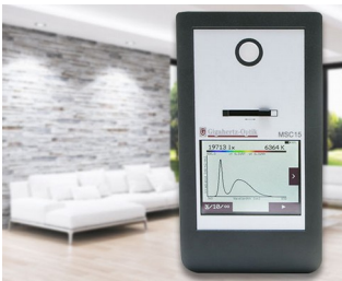
Spectral light meter