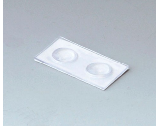
A9207150 Anti-slide feet 6.5 x 2 mm transparent