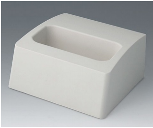
A9107507 Station L ASA+PC (UL 94 V-0) off-white RAL 9002