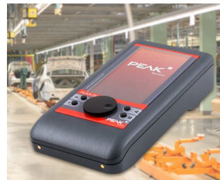
Mobile diagnostic device for CAN and CAN FD buses