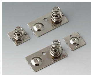
A9190023 Set of battery clips, 3 x AA Steel nickel-plated