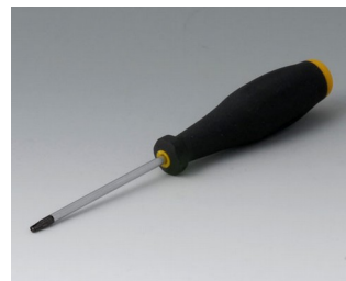
A0399T08 Torx T8 screwdriver