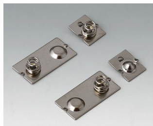
A9190024 Set of battery clips, 3 x AAA Steel nickel-plated