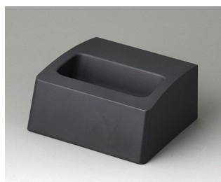
A9105508 Station S ASA+PC (UL 94 V-0) lava