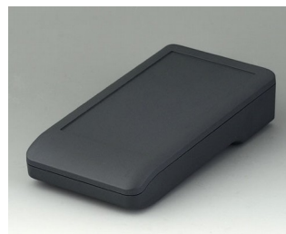
A9006118 DATEC-COMPACT M ASA+PC (UL 94 V-0) lava 172x92x39mm IP 41