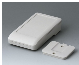
A9005217 DATEC-COMPACT S ASA+PC (UL 94 V-0) off-white RAL 9002 136x74x32mm IP 41