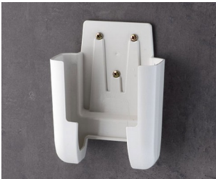
A9107627 Holder L ASA+PC (UL 94 V-0) off-white RAL 9002