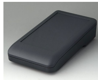
A9007118 DATEC-COMPACT L ASA+PC (UL 94 V-0) lava 206x110x47mm IP 41