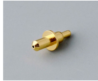
A9193031 Spring contact gold-plated