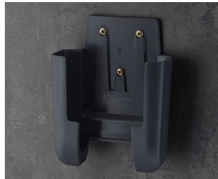
A9107628 Holder L ASA+PC (UL 94 V-0) lava