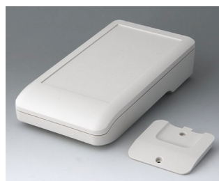
A9007217 DATEC-COMPACT L ASA+PC (UL 94 V-0) off-white RAL 9002 206x110x47mm IP 41