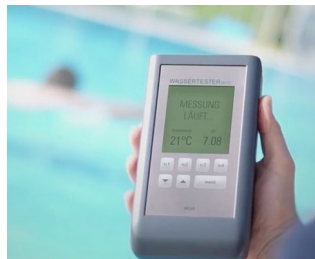
Electronic pool tester