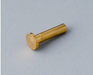
A9193030 Contact pin gold-plated