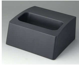
A9107508 Station L ASA+PC (UL 94 V-0) lava