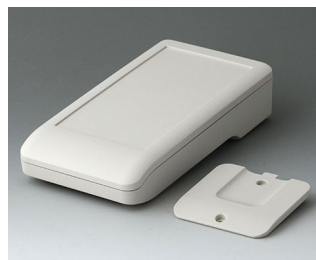
A9006217 DATEC-COMPACT M ASA+PC (UL 94 V-0) off-white RAL 9002 172x92x39mm IP 41