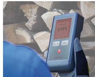
Wood moisture measuring device