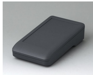
A9005118 DATEC-COMPACT S ASA+PC (UL 94 V-0) lava 136x74x32mm IP 41