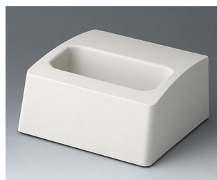
A9106507 Station M ASA+PC (UL 94 V-0) off-white RAL 9002