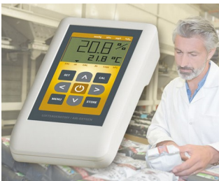
Atmospheric oxygen measuring unit