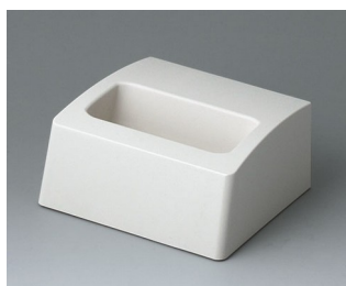
A9105507 Station S ASA+PC (UL 94 V-0) off-white RAL 9002