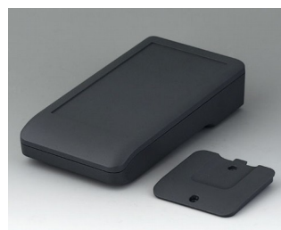
A9006218 DATEC-COMPACT M ASA+PC (UL 94 V-0) lava 172x92x39mm IP 41