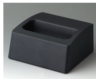
A9106508 Station M ASA+PC (UL 94 V-0) lava