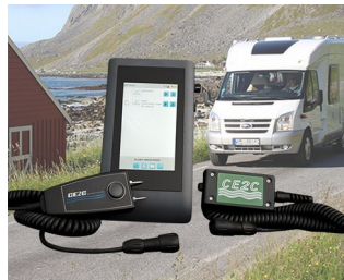
System for leak detection in leisure vehicles