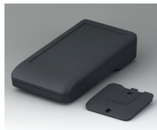
A9006218 DATEC-COMPACT M ASA+PC (UL 94 V-0) lava 172x92x39mm IP 41