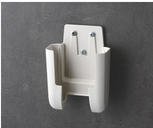
A9105627 Holder S ASA+PC (UL 94 V-0) off-white RAL 9002