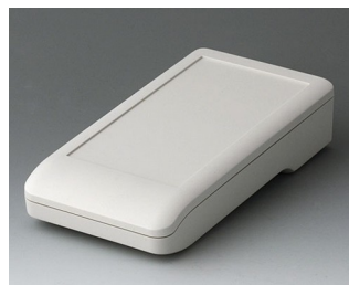
A9006117 DATEC-COMPACT M ASA+PC (UL 94 V-0) off-white RAL 9002 172x92x39mm IP 41