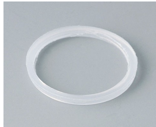
C2320126 Sealing ring for external thread M20x1.5 PE natural-coloured