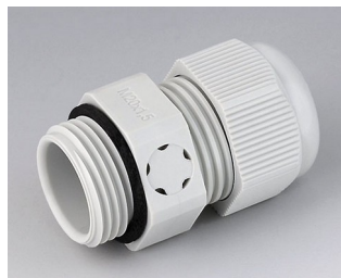
C2320917 Cable gland M20x1.5, pressure compensation PA light grey RAL 7035