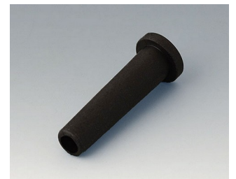
C2353849 Flexible cable grommet Ø 5,3 black