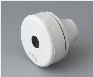
C2316137 Cable grommet EPDM light grey RAL 7035 IP 67