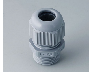
C2320418 Cable gland M20x1.5 PA silver grey RAL 7001