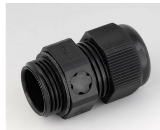
C2320919 Cable gland M20x1.5, pressure compensation PA black RAL 9005