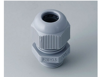
C2316418 Cable gland M16x1.5 PA silver grey RAL 7001 IP 68