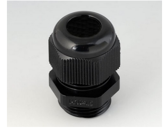
C2320419 Cable gland M20x1.5 PA black RAL 9005