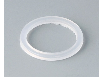
C2316126 Sealing ring for external thread M16x1.5 PE natural-coloured