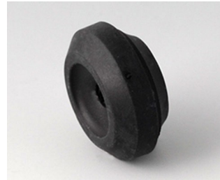
C2316159 Cable grommet TPE (UL 94 V-0) black RAL 9005 IP 67