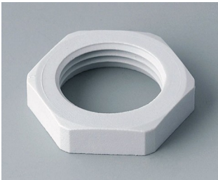
C2320117 Counternut M20x1.5 PA light grey RAL 7035