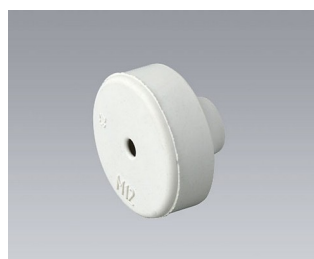
C2312137 Cable grommet EPDM light grey RAL 7035