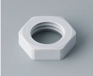
C2312117 Counternut M12x1.5 PA light grey RAL 7035