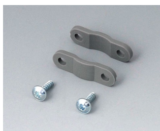
A9166004 Set of pull-relief PA 6 volcano