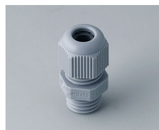
C2312418 Cable gland M12x1.5 PA silver grey RAL 7001