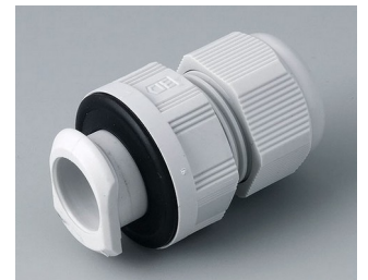
C2320717 Quick fix cable gland, M20 PA light grey RAL 7035