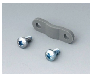
A9199005 Strain relief PA 6 volcano