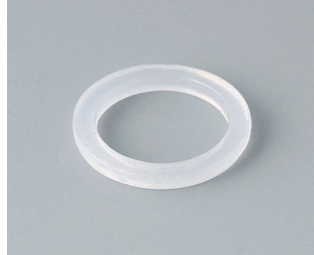
C2312126 Sealing ring for external thread M12x1.5 PE natural-coloured