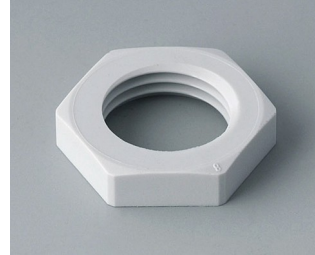
C2316117 Counternut M16x1.5 PA light grey RAL 7035